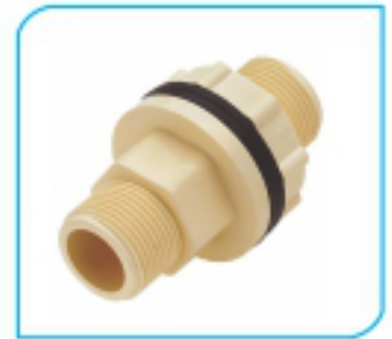
Tank Nipple Washer

Cost Effective:- Providing our products at good value where the benefits and usages are worth the price.