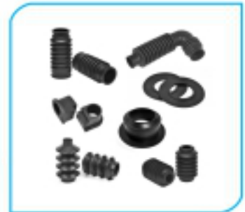
Bello Dust Cover