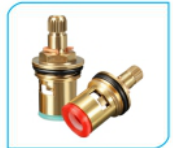
O-Ring & Washer